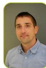
Filippos Zisopoulos Valorisation & Communication FACCE-JPI