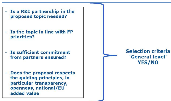
Figure 2: Selection Criteria: General level (illustrative for 'selection' phase of life-cycle)

Figure 2 illustrates that certain criteria such as 'partner commitment' are on a general level a 'Go/no-Go criterion', i.e. without sufficient commitment, a R&I partnership cannot be effectively conceived. On the other hand, 'partner commitment' is a necessary but not sufficient pre-condition for an R&I partnership as further pre-conditions have to be met. Again, no distinction between the different partnering approaches (PPP and P2P) is needed.